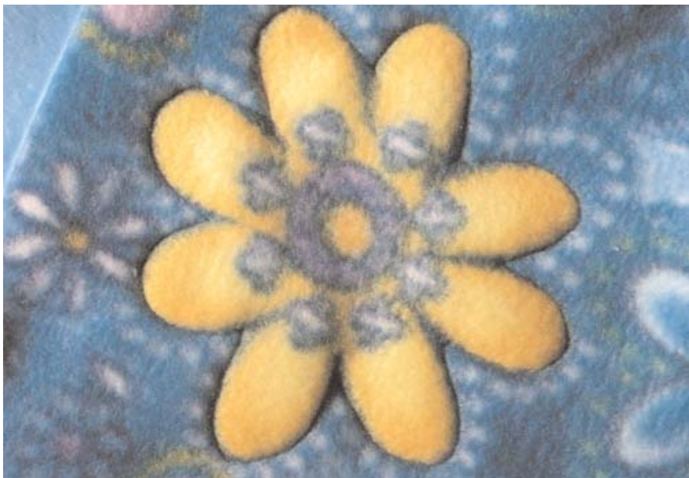
The loft of the fleece acts as the batting. Outline the flowers so they stand out on the floral and solid colored fabric.